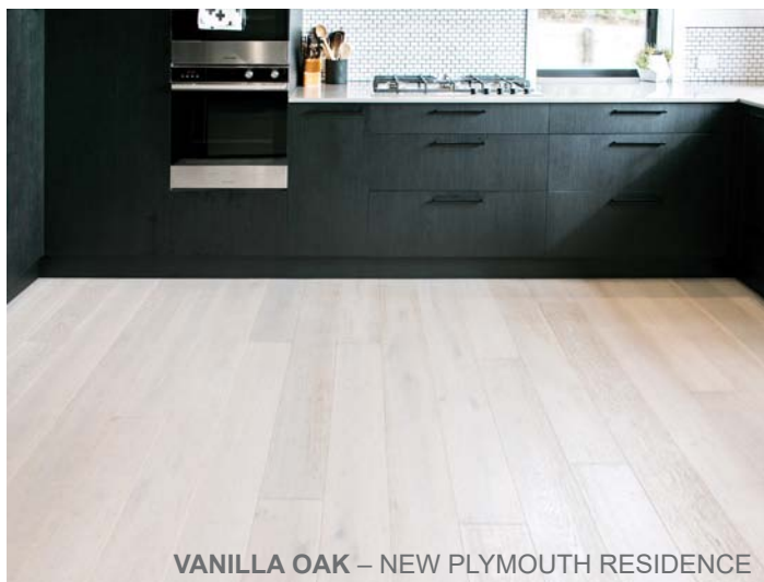
VANILLA OAK – NEW PLYMOUTH RESIDENCE

European Oak, Feature grade 189mm W x 15mm H x 2.2m L Lacquer finish Brushed surface 2.079m 2 /pk