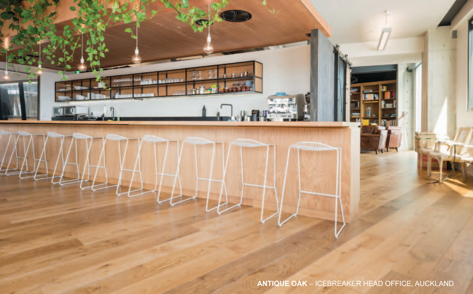
ANTIQUE OAK – ICEBREAKER HEAD OFFICE, AUCKLAND