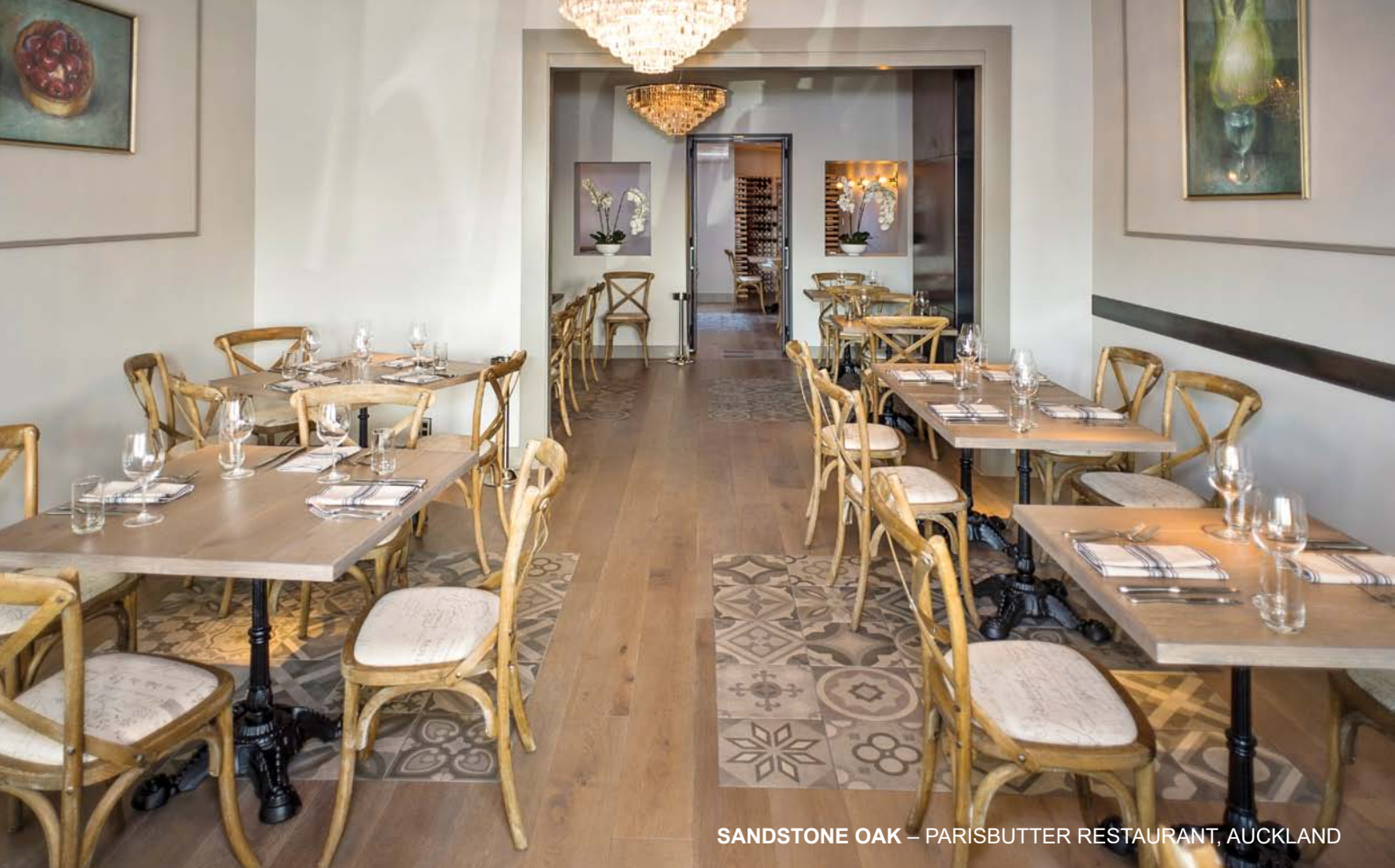
SANDSTONE OAK – PARISBUTTER RESTAURANT, AUCKLAND