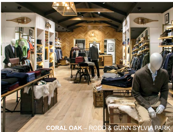
CORAL OAK – RODD & GUNN SYLVIA PARK

189mm W x 15mm H x 2.2m L Brushed surface 2.079m 2 /pk